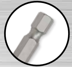
1/4" HEX POWER GROOVE SHANK