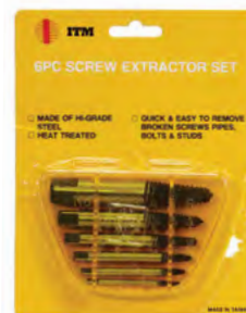
6 Pc. Set

Part # SE-006-16 6 Pc. Screw Extractor Set #1, #2, #3, #4, #5, #6 List $40.55