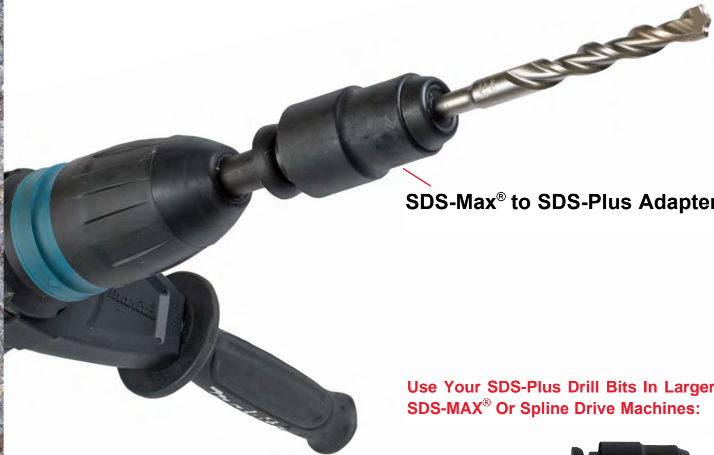
SDS-Max ® to SDS-Plus Adapter

Use Your SDS-Plus Drill Bits In Larger SDS-MAX ® Or Spline Drive Machines: